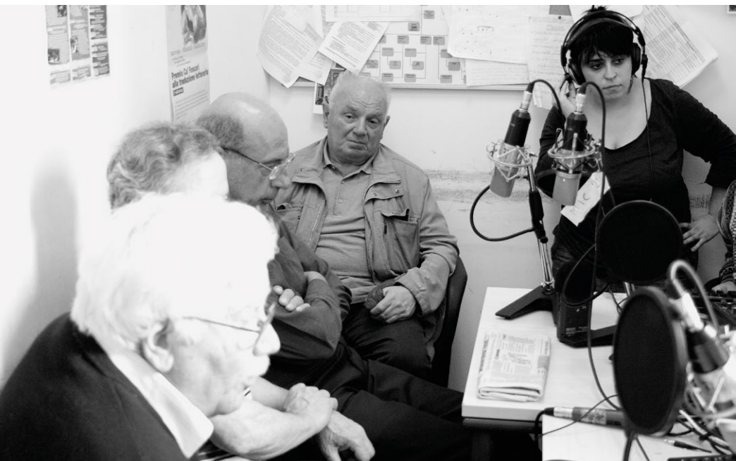
Estman Radio Drama, 2011, production photographs, recording session at Radio Ca' Foscari, Venice