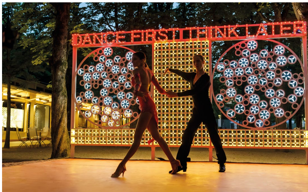
Dance First Think Later, 2022