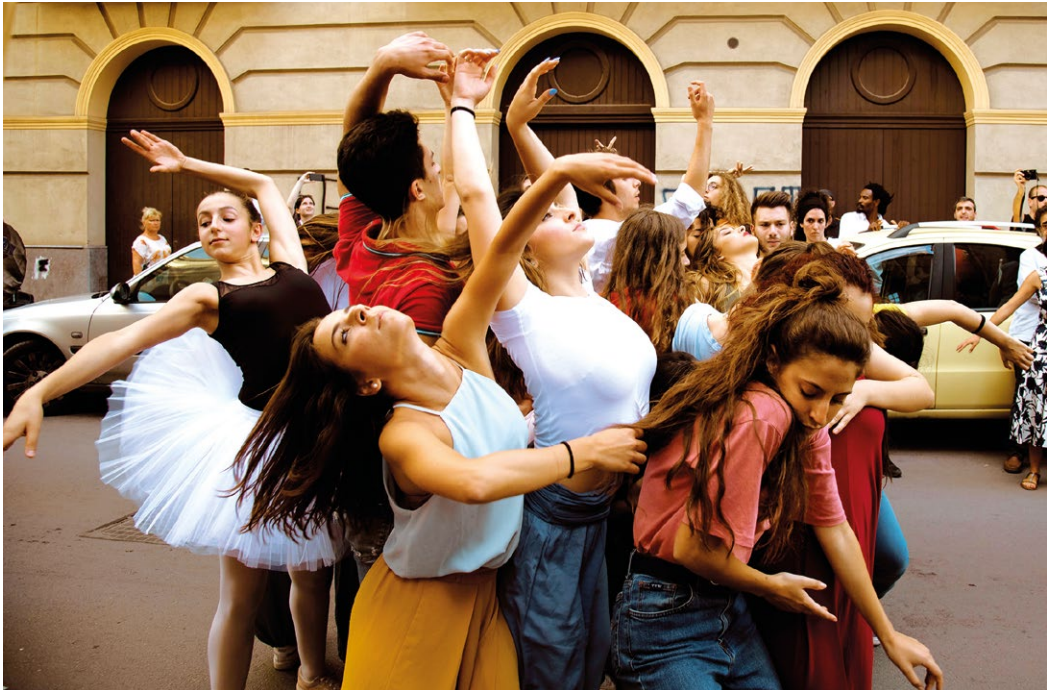
The School of Narrative Dance, Palermo Procession, 2018, as part of Manifesta 12, Palermo

The first realization of The School of Narrative Dance was in 2012 in Berlin. Since then there have been more than thirty further editions, including in Cold Spring, Cuenca, Ebensee, Évora, Copenhagen, Johannesburg, London, New York, Oulu, Palermo, Paris, Rome, Shenzhen, Stockholm, Turin, Venice, and Zurich. Expanded with each issue, the video Ongoing Documentary shows the ongoing story of The School of Narrative Dance .