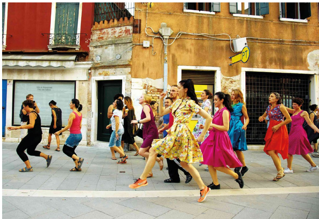
The School of Narrative Dance, Venice Parade, 2015, as part of The Creative Time Summit at the 56th Venice Biennale, Venice