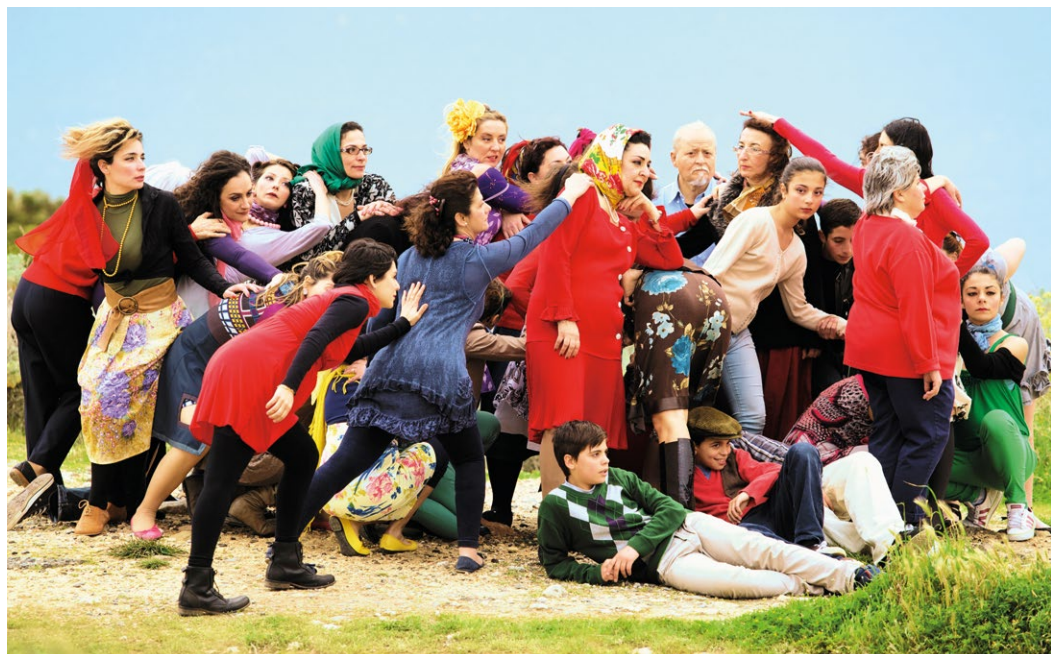
The School of Narrative Dance, Little Chaos, 2013