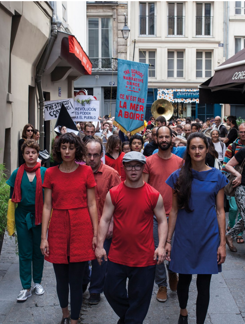
The School of Narrative Dance, Paris, 2017, as part of MOVE, Centre Pompidou, Paris