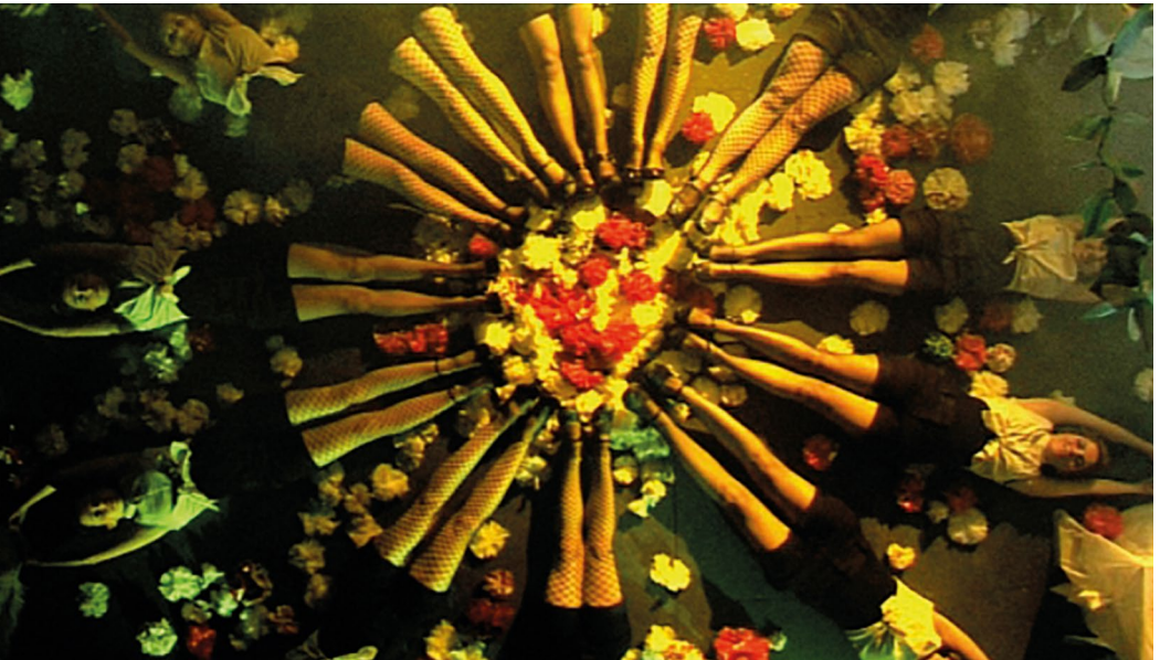
Speak Easy—Director’s Cut, 2009